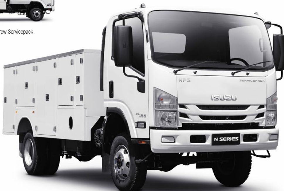
NPS 75-155 Servicepack

Fully powdercoated steel service body / Single cab: 9 lockable storage compartments. Crew cab: 7 lockable storage compartments. 4.0 cubic metre total volume / Single cab: 2.26m x 1.17m (L x W) central storage area with chequerplate floor and 5 tie down points. Crew cab: 2.16m x 1.17m (L x W) central storage area with chequerplate floor and 4 tie down points / Palfinger PC1500 crane (single cab only) / Storage compartment locking integrated with vehicle central locking system / LED lighting in each storage compartment / Rear barn door for central storage area (crew cab only) / Rear grab handles and non slip step surfaces / 3,500kg rated towbar with integrated rear step / Isuzu low light capable reversing camera